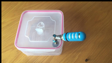
<< A CO2 CHAMBER.