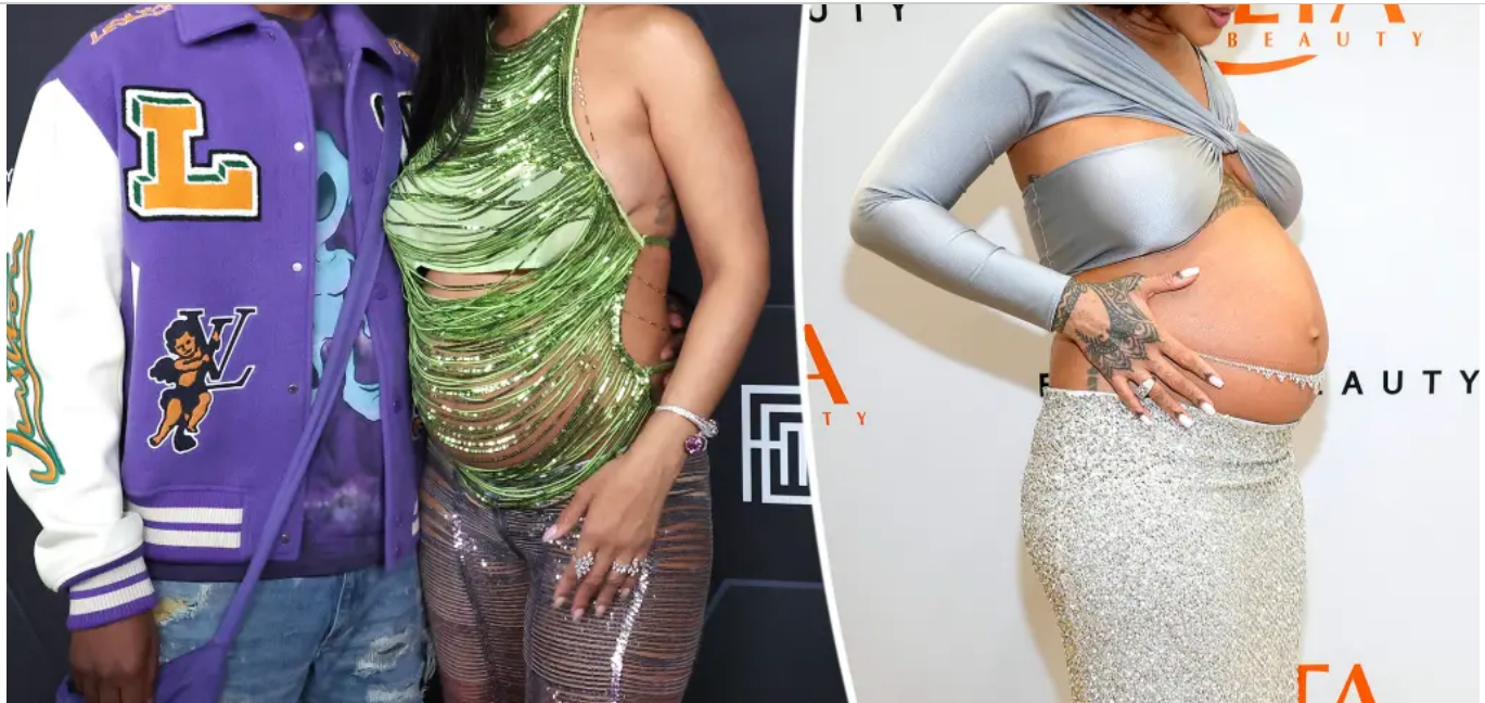
Rihanna gives birth, welcomes first baby with boyfriend A$AP Rocky