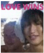
Flammable D Member