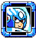
Cisce Community Resettler Member